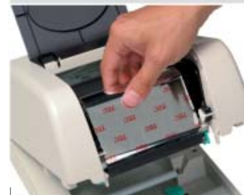
▼ Clip-in platen