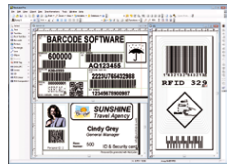
Design and print any industry specific compliance label within minutes

The NiceData module allows you to create and manage databases within NiceLabel.