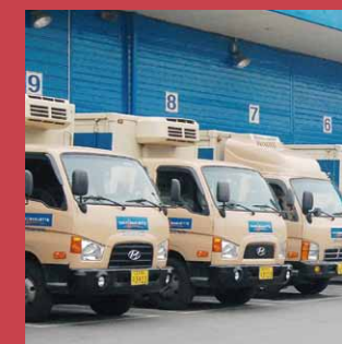
<Food & Beverage>