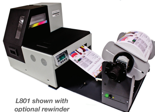
L801 shown with optional rewriter